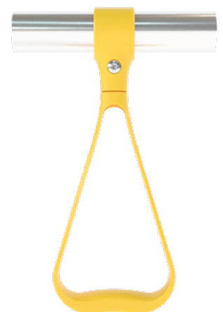
Handle fitted parallel to grab bar